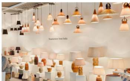
Product display in HKTDC 2019

collection embraced tremendous appreciation from each buyer, which was also our focal point of attraction. We are focusing mainly on such lamps to grab big retailers into our matrix.