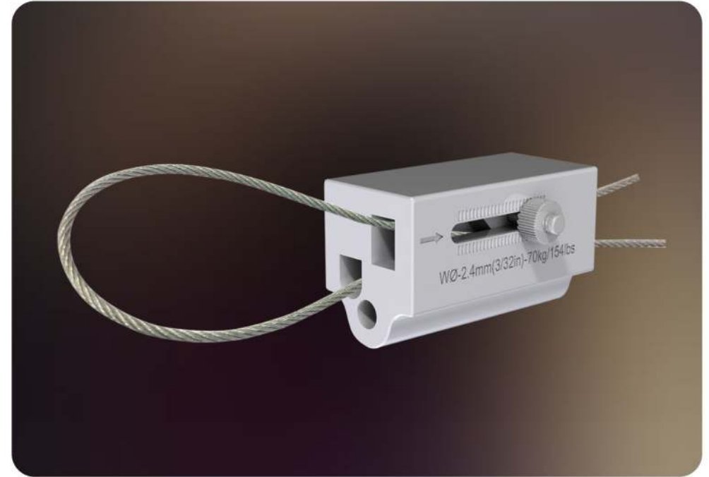
New Gripper, Patent Pending