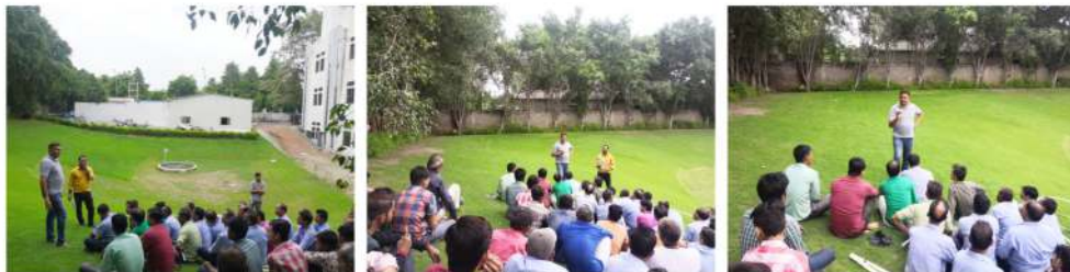
Workers gaining knowledge about Personal Protective Equipment at our unit 70-71, SEZ

We at GPL Group organized the Personal Protective Equipment training for our valuable employees on 17th August 2019 to make them aware of the importance of PPE. They were briefed regarding the usage of these equipments and how it will protect them while working on machines or any equipment which may cause injury to any part of their bodies.