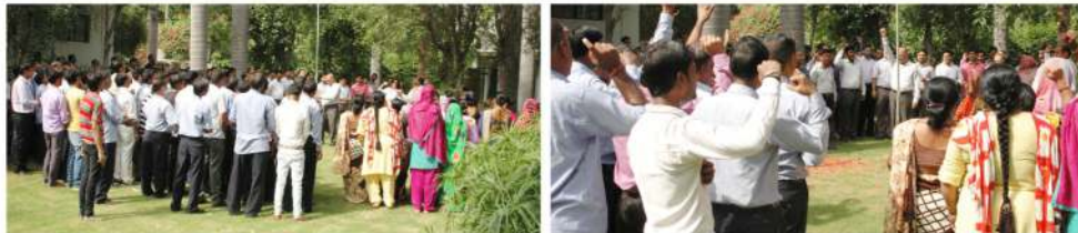
Workers and Staff honoring the national flag

Independence Day is annually celebrated on 15th August, as a national holiday in India, commemorating the nation's independence from the United Kingdom on 15th August 1947, the day when the UK Parliament passed the Indian Independence Act 1947, transferring legislative sovereignty to the Indian Constituent Assembly.