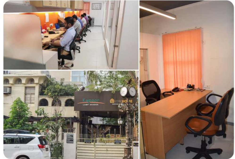
New set Up of Our office, Okhla Industrial Area, New Delhi