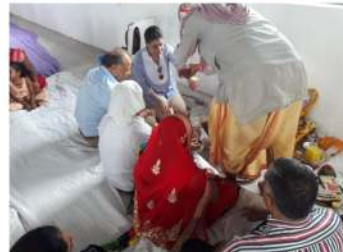
CMD & MD attending the Puja