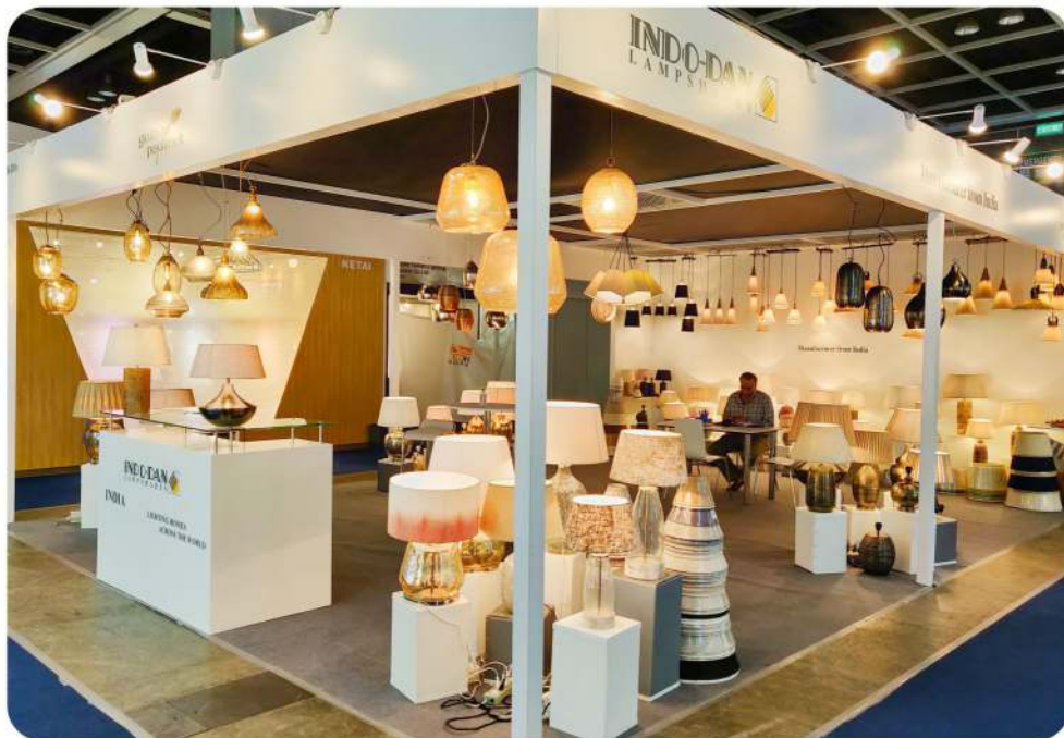
INDODAN stand at Hong Kong fair 2019