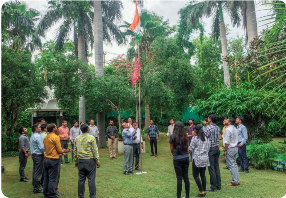
Independence day Flag hoisting