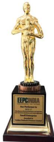
EEPC trophy 2016-17