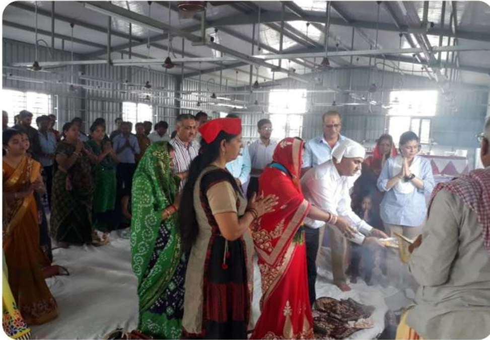
Staff Attending the Puja at Jam Nagar new unit