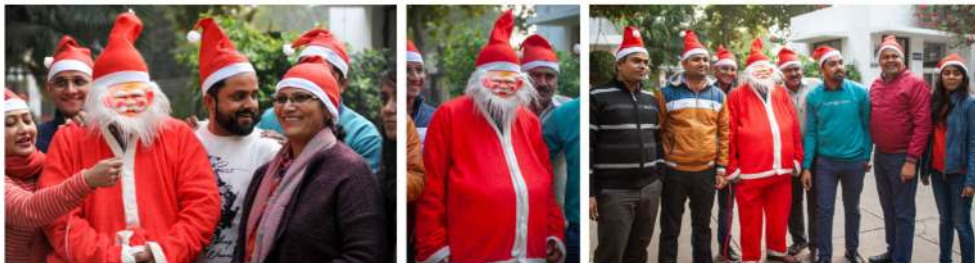
Enjoyment with santa

Christmas cake and Santa's Caps are distributed to every one in the office. All eagerly await for Santa Claus who distributes sweets from his goodie bag & clicking of photographs takes place with all the staff & management.