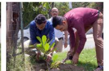
Planting a sapling for CMD's Green birthday Celebration in Noida & Jamnagar