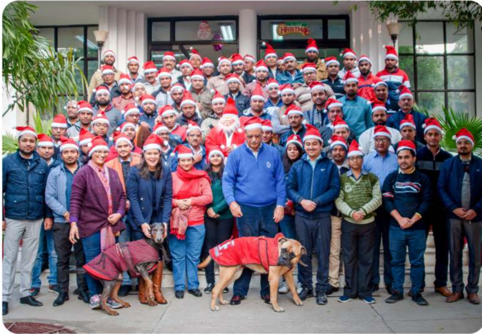
Christmas Celebration at Golden Peakcock