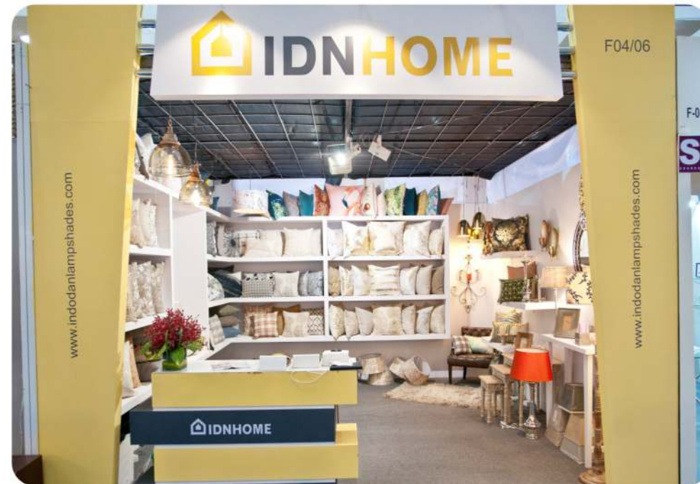
IHGF Autumn Fair 2019