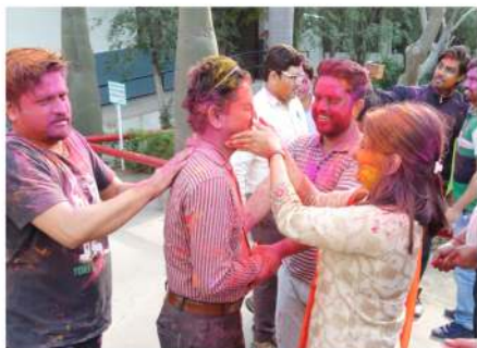
GPL Family enjoying the Festival of Colours

Holi - the festival of colours - is undoubtedly the most fun-filled and boisterous of Hindu festival. It's an occasion that brings in unadulterated joy and mirth, fun and play, music and dance, and, of course, lots of bright colours!