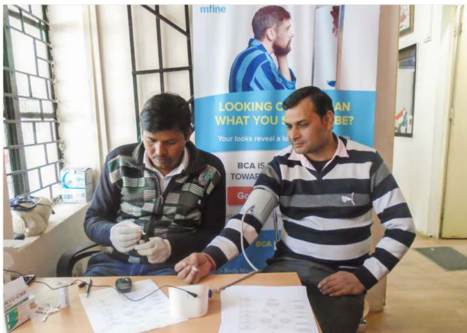
Staff being examined at the Factory Premises