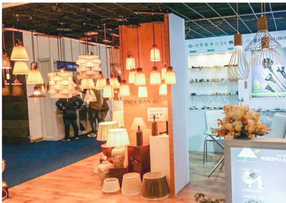
Indodan's stand at Indian Handicrafts & Gifts Fair (Spring) 18th -22nd Feb 2019