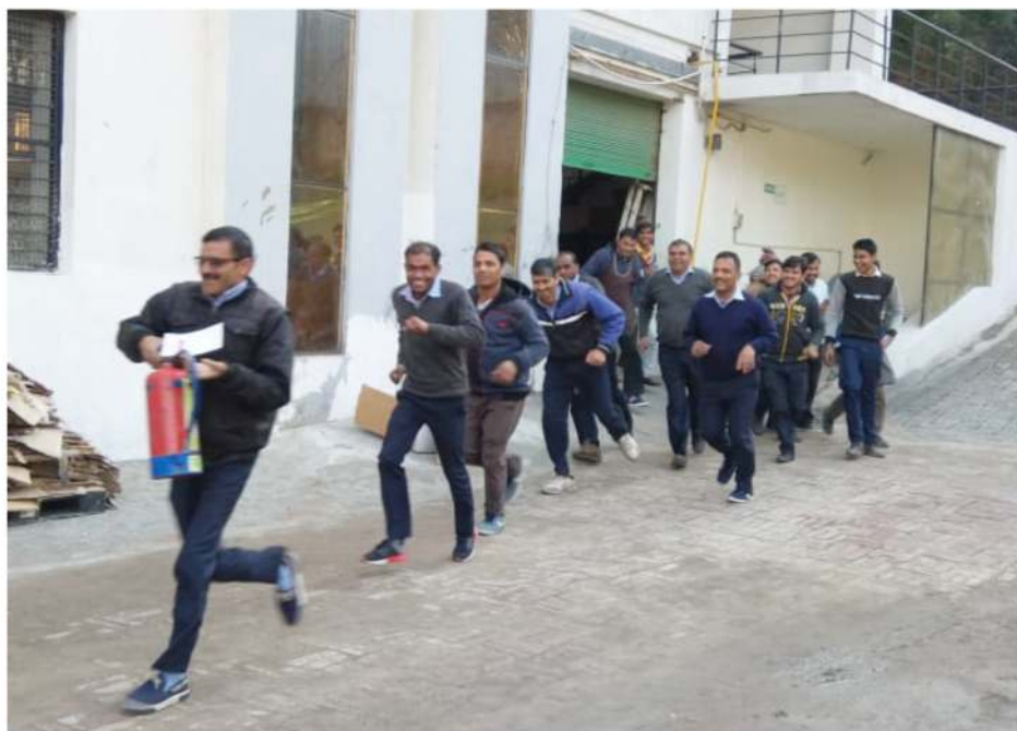
Mock drills at the Factory