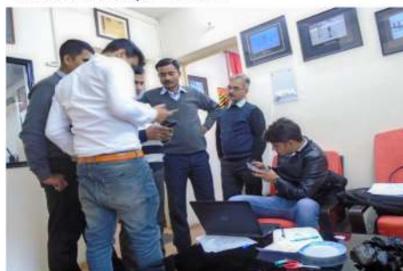
Interaction with the doctors

best quality health checkup instruments to provide the accurate information about the health parameters like Random Blood Sugar, Blood Pressure, Body fat % , Visceral Fat % , Skeletal Muscle Ratio, and BMI.