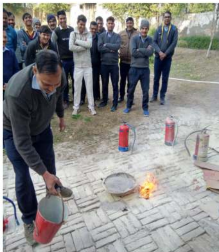
Worker's participating in fire fighting training

Our motive is to make aware our employees and visitors on how to respond in any emergency situation.